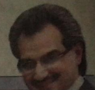
Managing Director Guwahati Smart City Limited